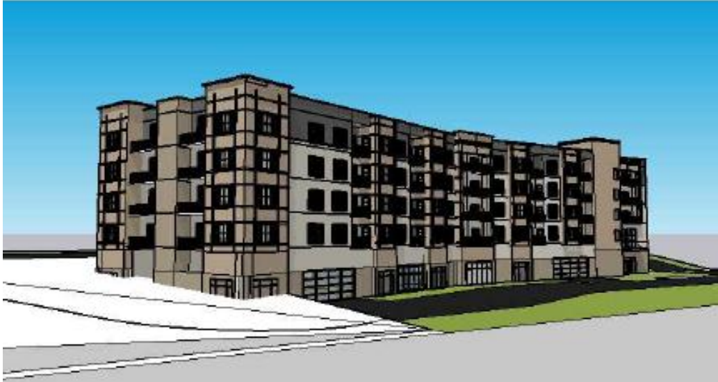
Rendering of proposed residential condominium building