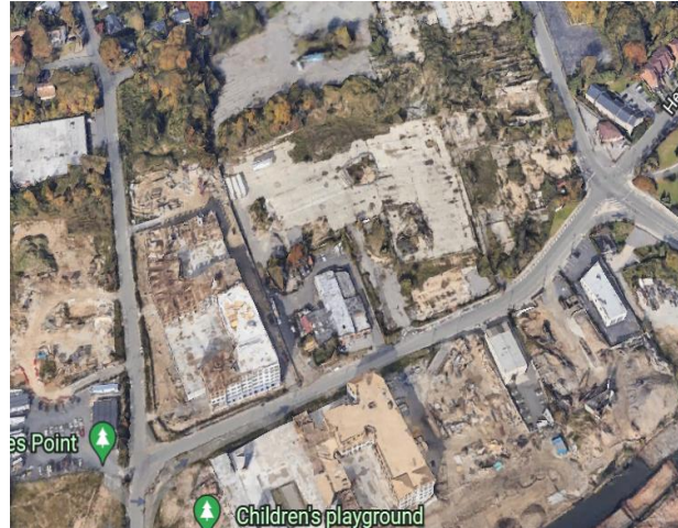
Satellite Image of Site